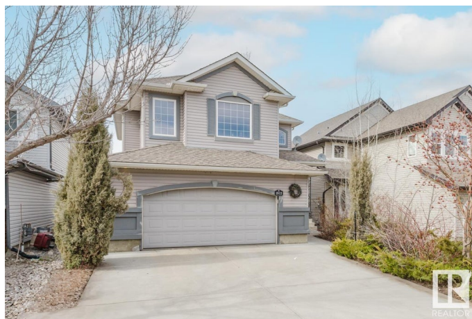
1912 121 St SW, Edmonton, AB